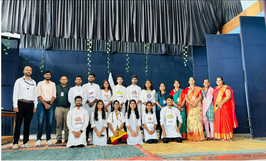
State level legendary & historical character and costume competition-19/08/2025