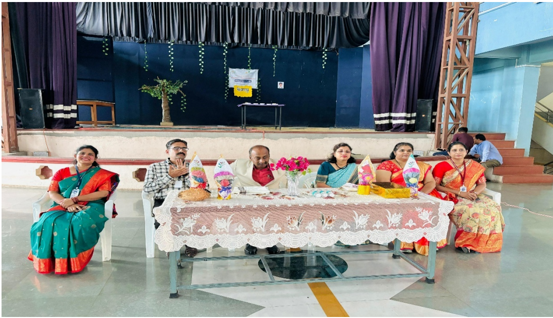
Drama in Sanskrit language – Sanskrit club activity- 29/07/2025