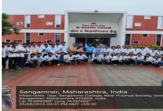
Out campus field visit – RARI, CCRAS, Pune – 10/09/2025