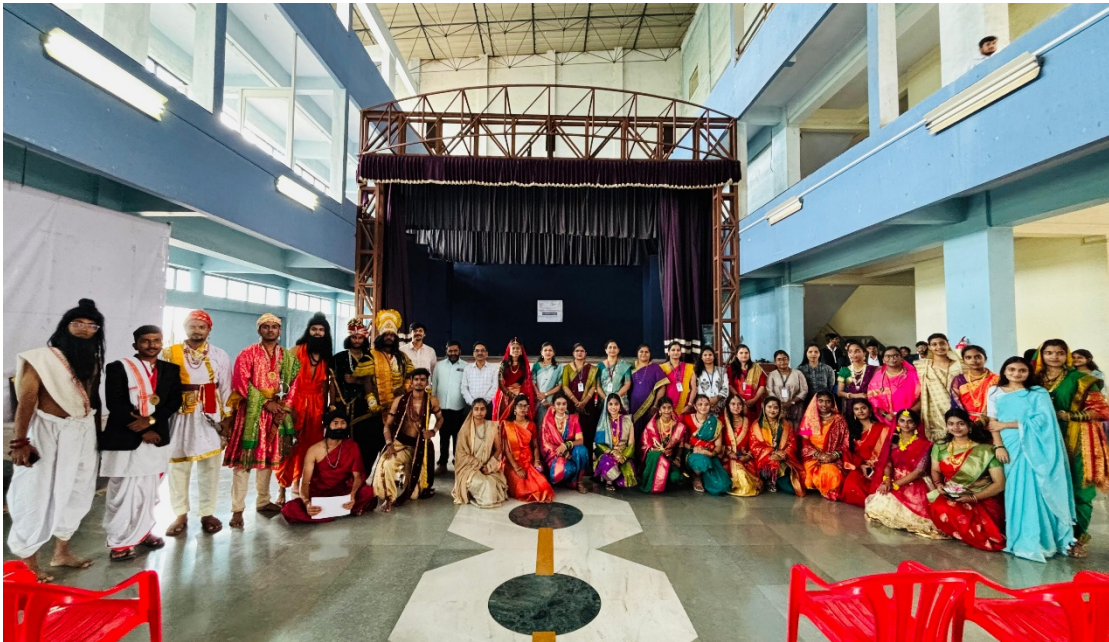
Visit- Yoga and Naturopathy Centre-