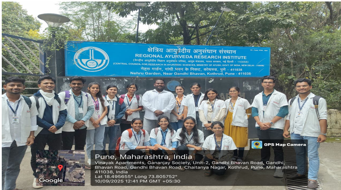
Nutritional laboratory visit CCRAS, Pune- 10/09/2025