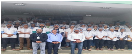
Sangamner, Maharashtra, India Sangamner, Maharashtra 422605, India Lat: 19.575915° Long: 74.159245° 26/09/2025 11:40 AM GMT +05:30